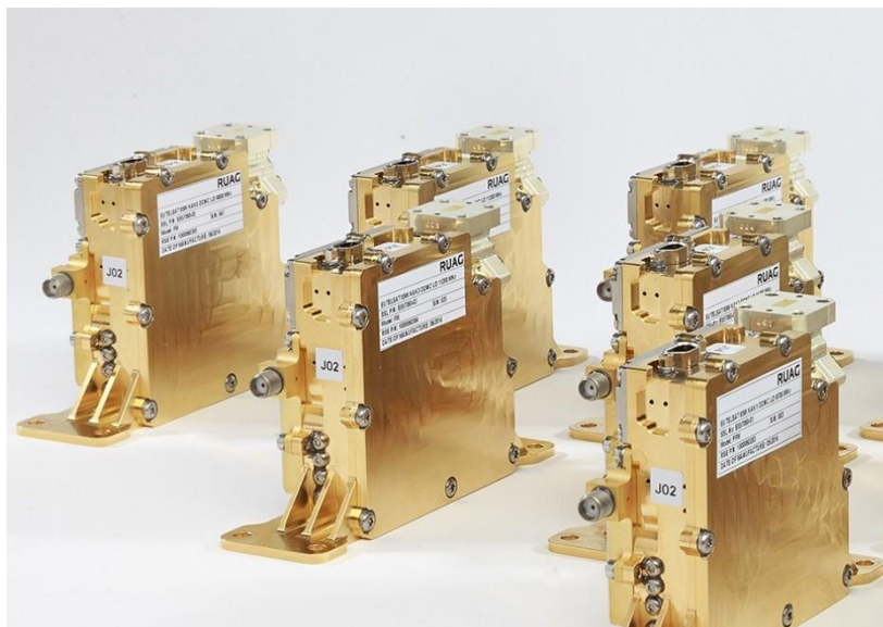
Figure 1 Microwave communication equipment for telecom satellites

Microwave communication equipment for telecom satellites (see Figure 1 ) are probably the most common equipment supplied by external producers within the supply chain for telecom satellites since they tend to be somewhat standard, at least when compared to for example the antenna subsystem which is always customized for the mission. The producer of microwave equipment delivers to the supply chain actor in charge of the satellite payload which could be the Prime (system integrator) itself or a separate supplier that supplies the full, tested payload to the Prime.